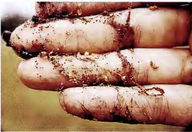
Figure 1. Utricularia biovularioides at Chapada dos Veradeiros, Brazil. Note the minute red traps. See article this issue.